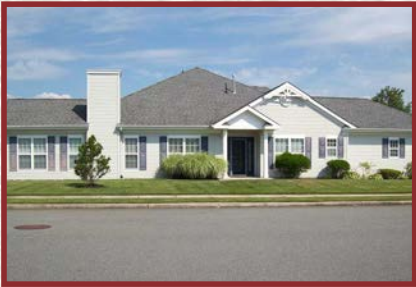
GREAT CORNER PROPERTY IN DESIRED LOCATION! (1731 Us Rt. 9 S Unit 106) Two bedroom and two bath townhouse situated in Beautiful Osprey Point, an active age restricted community. $307,900