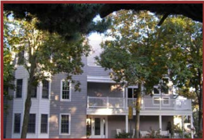
CUSTOM BUILT HOME! (517 Sandalwood Rd) Three bedroom, two and one-half bath single family home located just across the street from Delaware Bay beaches. $559,000