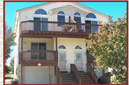
WELL MAINTAINED TOWNHOME! (126-36th Street East Unit) Four bedroom and two bath located near Sea Isle's downtown restaurants. $645,000