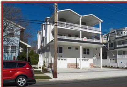
VERY RARE NEW CONSTRUCTION SEA ISLE TOWN HOUSE! (4410 Central ave. South Unit) Seven Bedroom, five and one-half bath home located in the center of town. $869,000