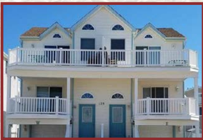
IMMACULATE MOVE- IN CONDITION SEASHORE HOME! (129-69th Street West Unit) Four bedroom, two and one-half bath townhouse. $729,000