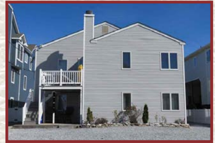
OCEAN WAY CONDOMINIUMS. (113-60th St. Unit B) Three bedroom and two bath first floor front unit. $385,000