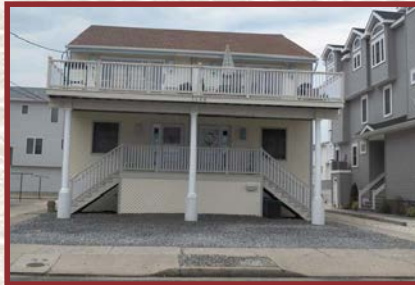
JUST ONE BLOCK TO THE BEACH! (7108 Landis ave. South Unit) Four bedroom and two bath townhouse located one block from the beach. $579,000