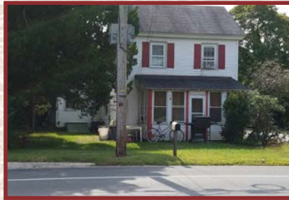
MULTI-FAMILY DWELLING ON THE MAINLAND! (1782 US Rt. 9) Multiple Units, great rental income. $324,900